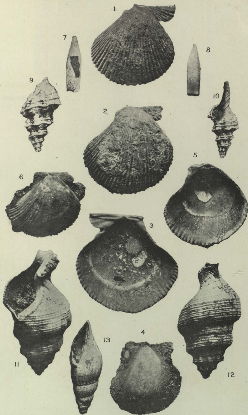
FIG. 1.— Pecten costato-striatus n. sp. FIG. 2.— Pecten costato-striatus n. sp. FIG. 3.— Pecten costato-striatus n. sp. FIG. 4.— Pecten subconvexus n. sp. FIG. 5.— Pecten subconvexus n. sp. FIG. 6.— Pecten subconvexus n. sp. FIG. 7.— Vaginella torpedo n. sp.