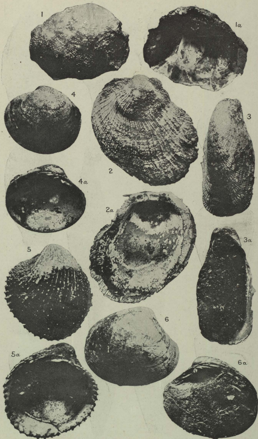
FIGS. 1, 1a.— Anomia poculifera n. sp. FIGS. 2, 2a.— Spondylus aucklandicus n. sp. FIGS. 3, 3a.— Mytilus torquatus n. sp. FIGS. 4, 4a.— Dosinia tumida n. sp.