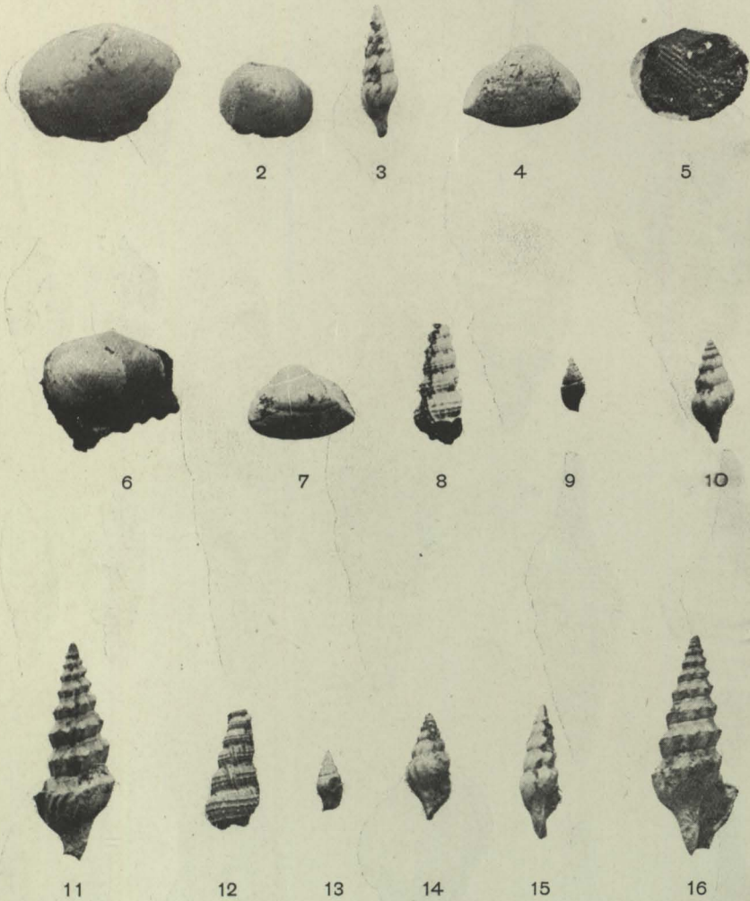
FIG. 1.— Tellina ( Arcopagia ) inconspicua n. sp. FIG. 2.— Tellina ( Arcopagia ) inconspicua n. sp. ( \times 2 ). FIG. 3.— Surcula nitens n. sp. FIG. 4.— Corbula nitens n. sp. FIG. 5.— Sarepta aucklandica n. sp. ( \times 2 ). FIG. 6.— Sarepta aucklandica n. sp. FIG. 7.— Corbula nitens n. sp.