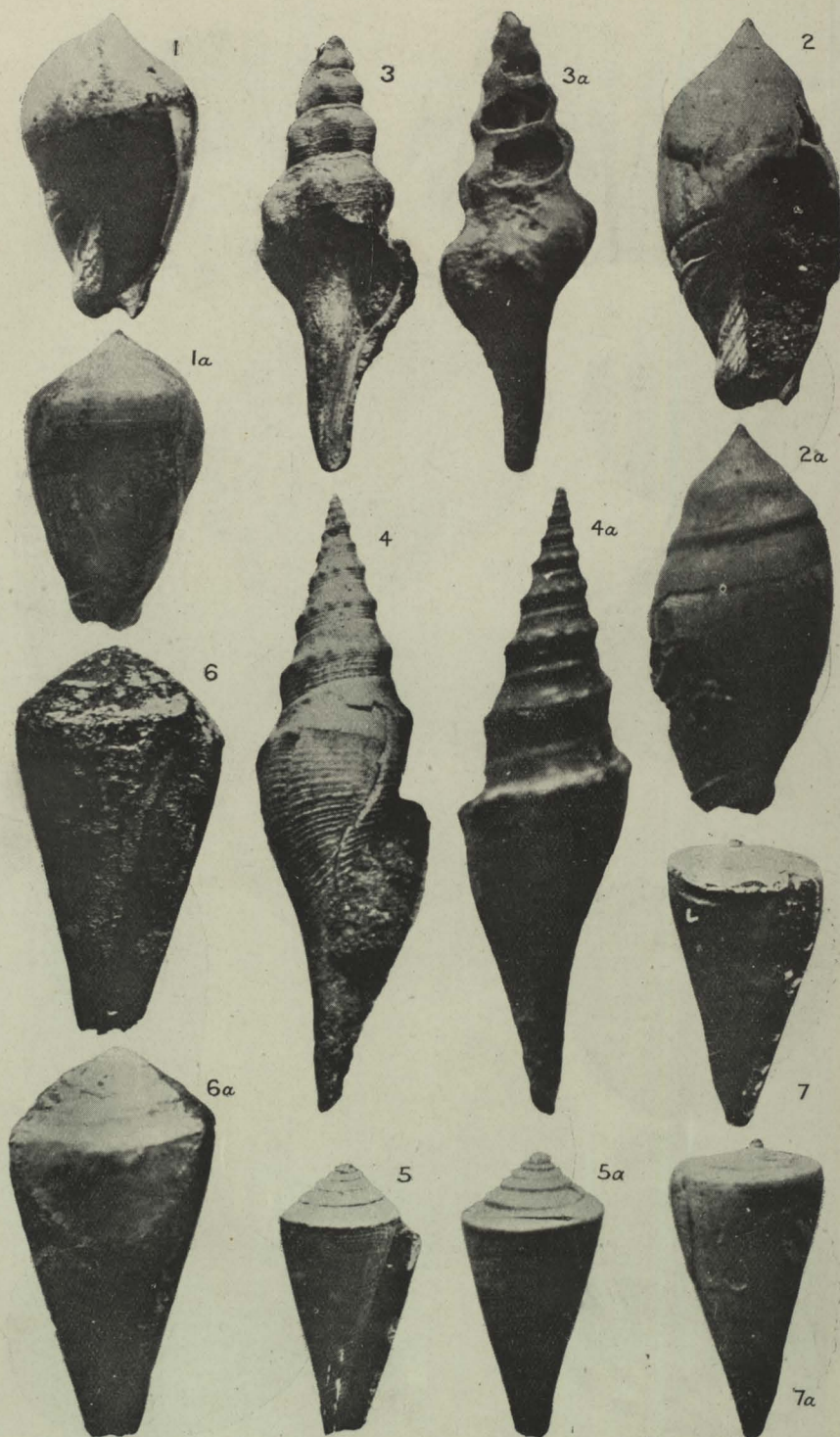
FIGS. 1, 1a.— Ancilla spiniyera n. sp. FIGS. 2, 2a.— Ancilla cincta n. sp. FIGS. 3, 3a.— Surcula latiaxialis n. sp. FIGS. 4, 4a.— Surcula ordinaria n. sp.